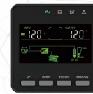
Cost-effective Green LCD