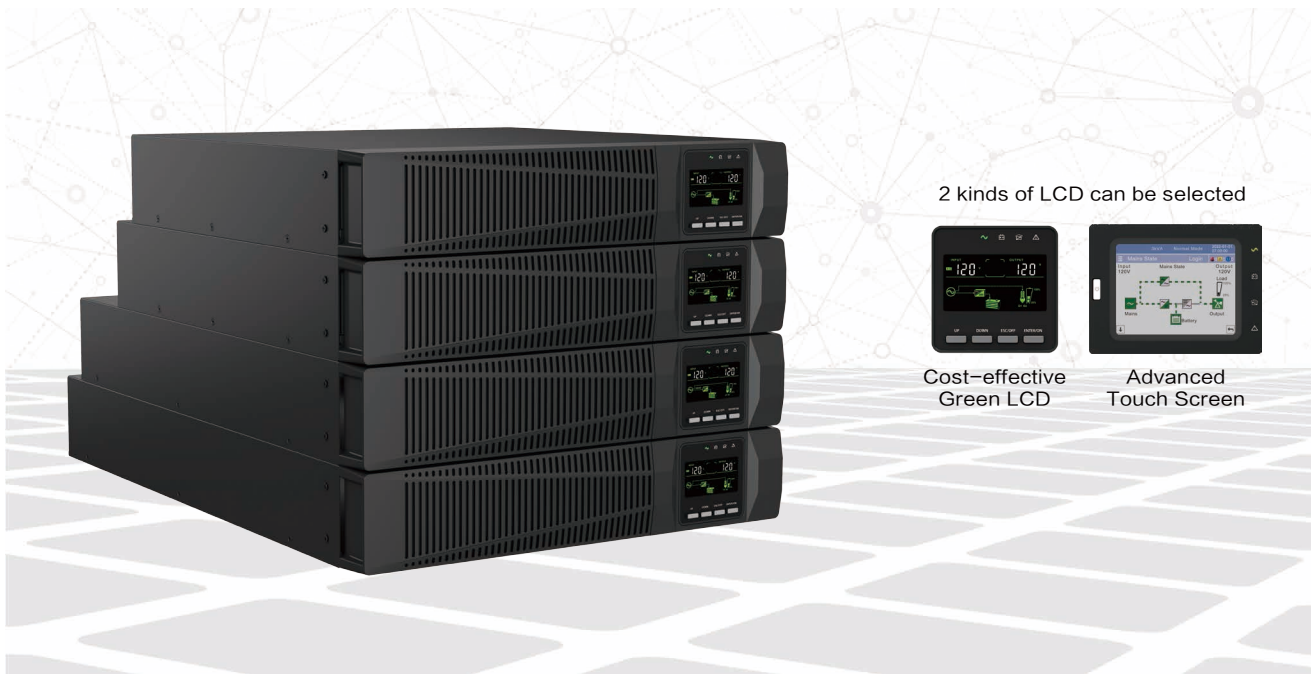
2 kinds of LCD can be selected