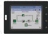
Advanced Touch Screen